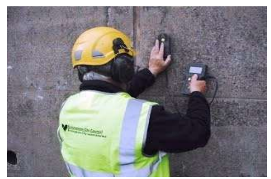
Fig.-4- Bar Locator and Cover Depth Meter

The cover meter technique is the least complicated and least expensive of all the NDT techniques. This test is used to assess the location and diameter of reinforcement bars and concrete cover. Principle: based on the measurement of change in electromagnetic field caused by steel embedded in the concrete. Equipment: Photometers comprise a search head, meter and interconnecting cable. The concrete surface is scanned, with the search head kept in contact with it while the meter indicates, by analogue or digital means, the proximity of reinforcement.