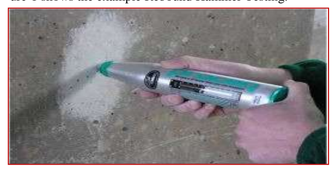
Figure-1 - Rebound Hammer Testing

The rebound hammer (such as the Schmidt Hammer) is Consist of a spring control hammer that slides on a plunger within a tubular housing. When the plunger is pressed against the surface of the concrete, the mass rebound from the plunger. It reacts against the force of spring. The Distance travelled by the mass, is called rebound number. The Schmidt rebound hammer is basically a surface hardness tester & testing as per IS: 13311 (Part 2): 1992 & BS 1881: Part 202: 1986, the rebound of an elastic mass depends on the hardness of the surface against which mass strikes. Figure-1 shows the example Rebound Hammer Testing.