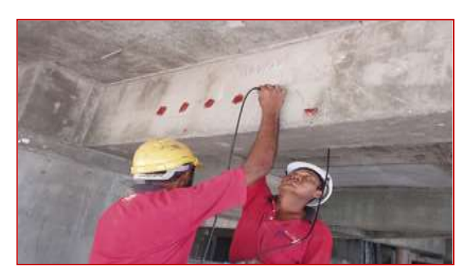
Figure-2 Ultra Pulse Velocity Testing

The UPV method involves measuring the speed of travel of an ultrasonic pulse through concrete. This speed is influenced by the density and elastic modulus of the concrete. It is often used for relative strength assessments. The technique is most effective and economic for comparative assessments of quality (density) and detection of voids, delamination and under compacted and honeycombed areas because the pulse takes longer to travel around defective areas.